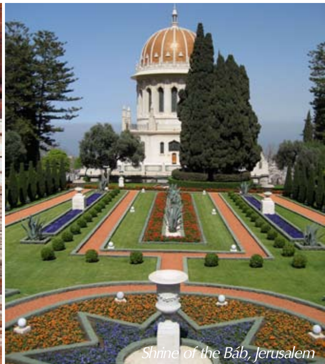
Shrine of the Báb, Jerusalem