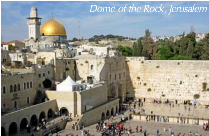
Dome of the Rock, Jerusalem