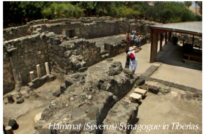
Hammat (Severus) Synagogue in Tiberias